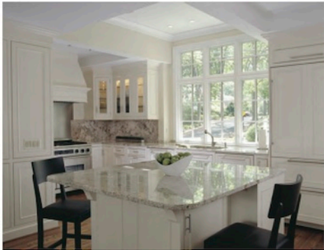
This photo did not appear in the original article.